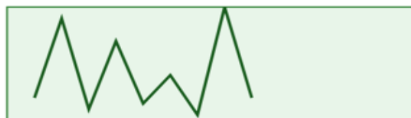
Figure 1: High-resolution metabolic fingerprinting showing distinct elution peaks for bioactive steroids.

Fresh samples were collected during the monsoon and post-monsoon seasons (2025) from the campus of UP Autonomous College and peripheral riparian zones. Extraction: Samples were shade-dried and extracted using ultrasonic-assisted hydro-ethanolic solvents. Targeted Profiling: Validated HPLC methods were used for quantification. Untargeted Profiling: Data-dependent acquisition (DDA) on a Q-Exactive Orbitrap MS was utilized to capture the global metabolite features, subsequently processed through MZmine 3 software.